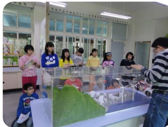
Energy Education Center