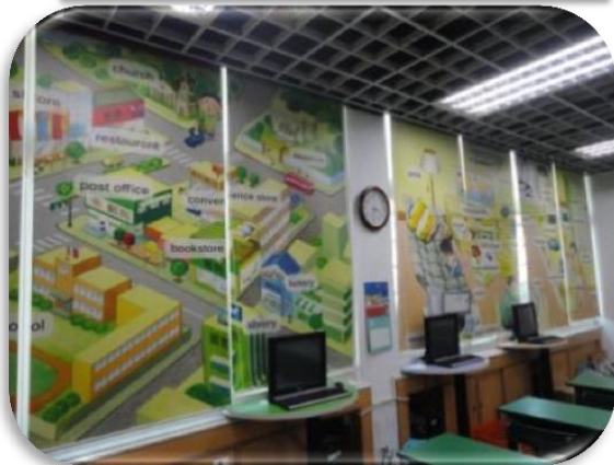
English Learning classroom